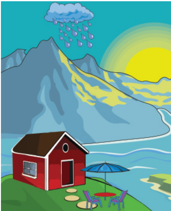
Non-living things of the environment